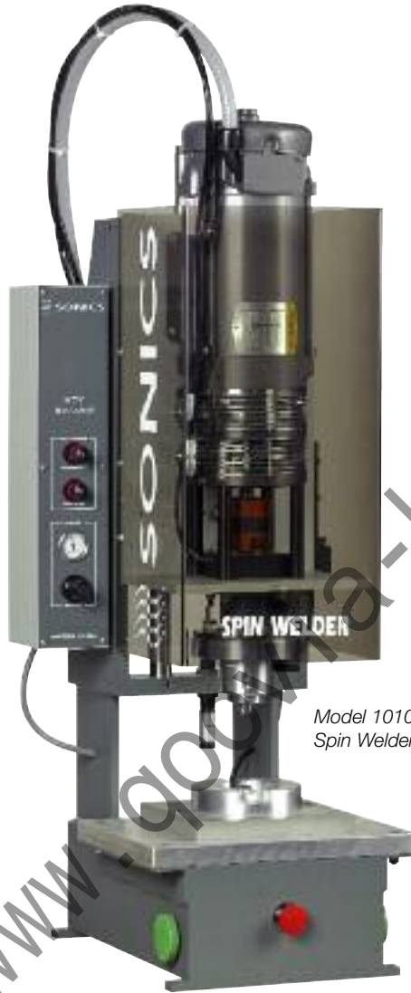
Model 1010 Spin Welder