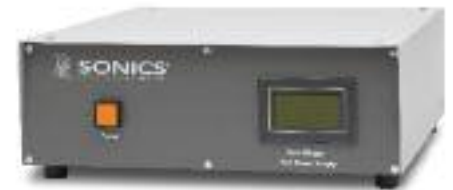
SPX Power Supply

Spin welding, also referred to as rotary friction welding, is the joining technology of choice when assembling spherically or cylindrically shaped thermoplastic parts.